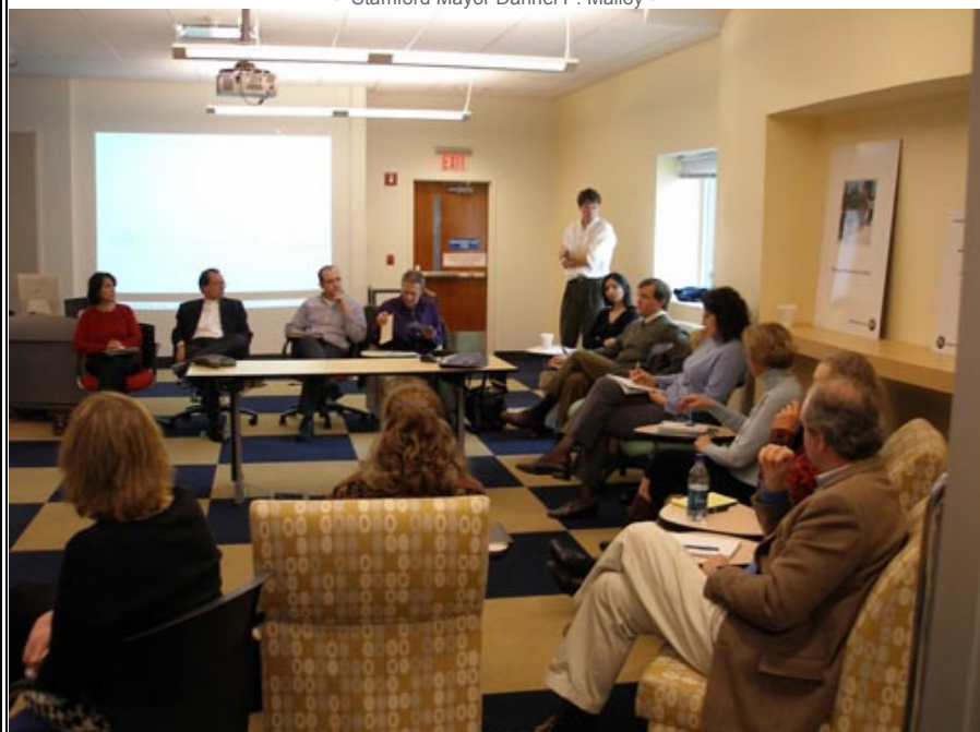
- The Imaginarium -